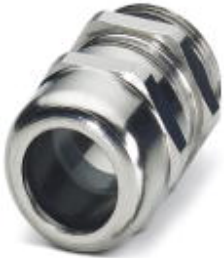
Cable gland, Cable gland material: Brass, nickel-plated, External cable diameter 4 mm ... 8 mm, Shielding: No, Connecting thread: Pg9, Color: silver

Please be informed that the data shown in this PDF Document is generated from our Online Catalog. Please find the complete data in the user's documentation. Our General Terms of Use for Downloads are valid ( http://phoenixcontact.com/download )