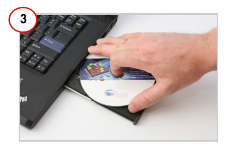
Insert the kit CD and run the CD's autorun utility.