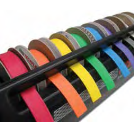
Shrinkflex shop spools fit into our dispenser kit (pg. 101) for easy storage and organization.