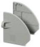
Flange cover, Color: gray