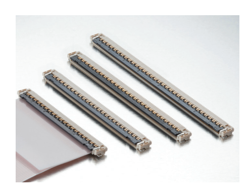
Slim Type 0.50mm Pitch FFC/FPC Connectors

104112 56-Circuits104075 68-Circuits104114 80-Circuits104083 96-Circuits