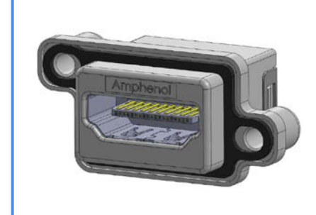
MHDR-A111-30 TYPE A, RIGHT ANGLE