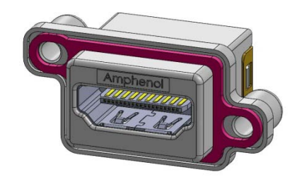
MHDR-A511-30 TYPE A, VERTICAL