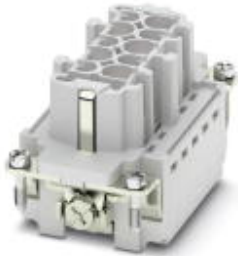
HEAVYCON socket insert, for 830 V (III/3), with 3 N/O contacts and 2 switch contacts, crimp connection

Please be informed that the data shown in this PDF Document is generated from our Online Catalog. Please find the complete data in the user's documentation. Our General Terms of Use for Downloads are valid ( http://phoenixcontact.com/download )