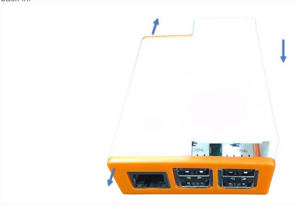
Step 4 – Push out gently the sides of the bottom part of the case to allow for the white panels to slot back in.

At this point the Flick HAT is ready to be used.