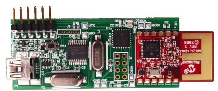
WSN-AP-01 Access Point