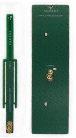
Receiving Antennas Dipole and Patch