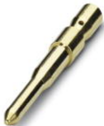
Crimp contact, turned, contact diameter: 1.5 mm, crimp range: 0.5 mm 2 ... 1 mm 2

Please be informed that the data shown in this PDF Document is generated from our Online Catalog. Please find the complete data in the user's documentation. Our General Terms of Use for Downloads are valid ( http://phoenixcontact.com/download )