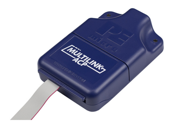
USB Multilink ACP Debug Probe