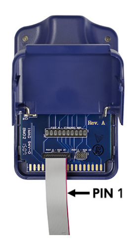
Multilink ACP Header Layout (Pin 1 Highlighted)

There are two LEDs on the Multilink interface. The blue LED indicates that the interface is powered and running. The yellow LED indicates that target power has been detected.