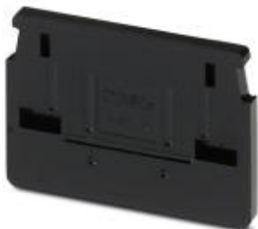
End cover, length: 46 mm, width: 3.5 mm, height: 30.7 mm, color: black

Please be informed that the data shown in this PDF Document is generated from our Online Catalog. Please find the complete data in the user's documentation. Our General Terms of Use for Downloads are valid ( http://phoenixcontact.com/download )