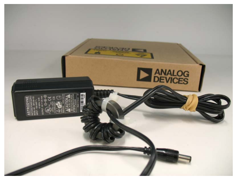
Figure 3: Power supply modification to SPU15A-103 switching power supply.

Otherwise, email the HSC Applications Group at <u>highspeed.converters@analog.com</u> and ask for Part Number: EPS060250UH-P5P-SZ, CUI Inc. switching power supply. This switching power supply has a ferrite core built into the DC lead to snub any switching noise.